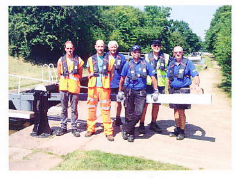
A job well done: the volunteers by the canal

The volunteers, many of whom have been Network Rail staff like